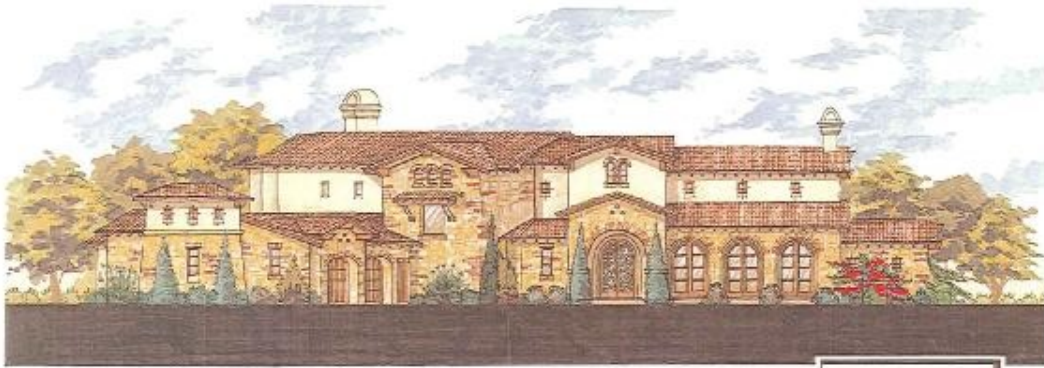
Gatewood Spec @ Belvedere